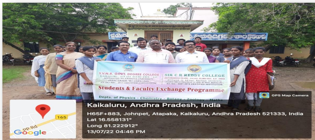
At Y.V.N.R. Govt. Degree College, Kaikaluru, Krishna District