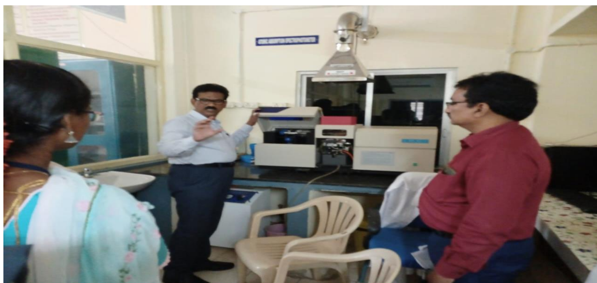
VISIT TO RESEARCH LABORATORY