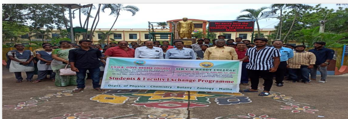
Sir C.R. Reddy College, Eluru